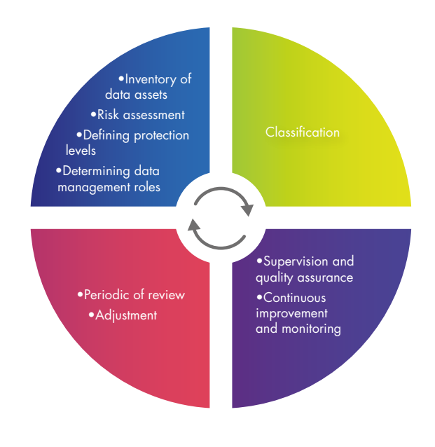
Figure 2- Recommendations for Establishing a data classification system

Beyond the continuous monitoring and assessment, periodic systematic reviews enable adjustments to data access and review of classified data. A reclassification and revision methodology can ensure that security measures are applied that are suited to the current technology and threat/ risk environment, but also the changing value and sensitivity of the classified data. Classified information should be reviewed regularly to prevent legacy information lingering, which is costly to store and manage. It is advisable to likewise review classification policies and procedures on a periodic basis.