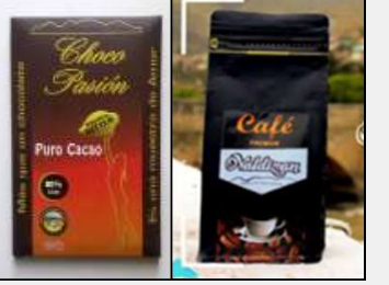
Revenue from sale of coffee beans and derivatives