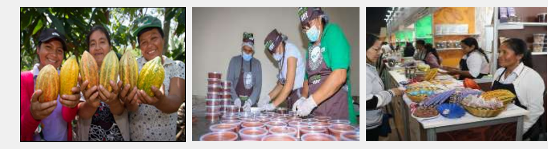
Revenue from sale of cocoa beans and derivatives