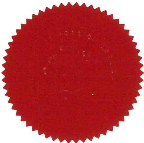
Kamina Johnson Smith Minister of Foreign Affairs and Foreign Trade

IN WITNESS WHEREOF , I have signed this Instrument of Accession at Kingston, Jamaica on the 12 th day of September, Two Thousand and Twenty-Four.