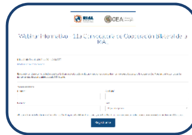
Webinars and forums