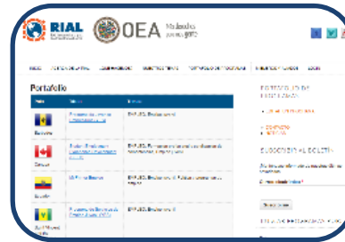
Portfolio of Programs