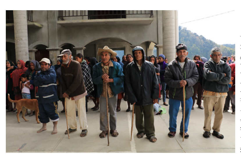
Migrantes (Ayutta migración desplazados de Guadalu Adrián Acevedo

Guarantee the broadest and most effective participation possible by civil society organizations and social and community actors working on internal displacement issues, internally displaced persons, and national human rights institutions in the process of formulating, implementing, monitoring, and evaluating policies and/or programs to protect the rights of IDPs.