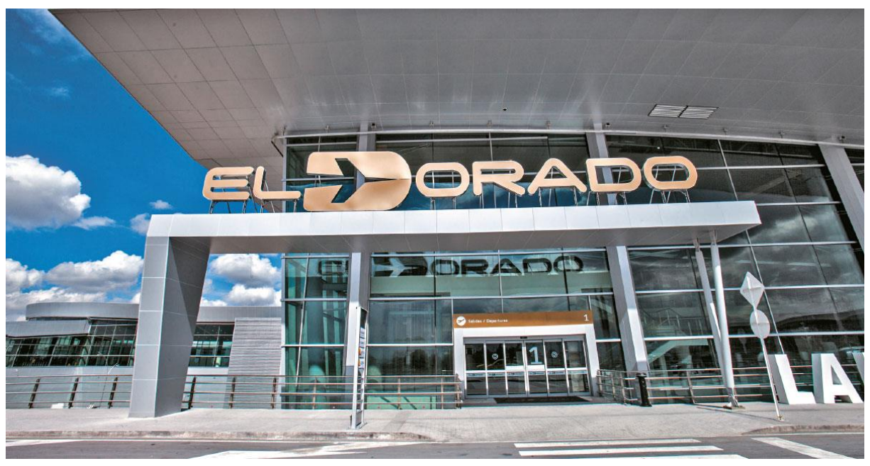
El Dorado International Airport – Bogota (Colombia) Address: Calle 26 No. 103-09 https://eldorado.aero

The distance between the El Dorado International Airport and the meeting venue is 13.8 kilometers / 8.5 miles. The transfer lasts about 25 minutes, depending on the traffic conditions.