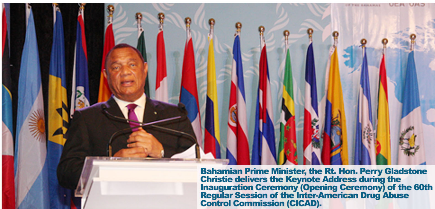
Bahamian Prime Minister, the Rt. Hon. Perry Gladstone Christie delivers the Keynote Address during the Inauguration Ceremony (Opening Ceremony) of the 60th Regular Session of the Inter-American Drug Abuse Control Commission (CICAD).

PARADISE ISLAND, The Bahamas – Bahamian Prime Minister and Minister of Finance, the Rt. Hon. Perry Gladstone Christie, commended the Organization of American States and, more specifically, its Inter-American Drug Abuse Control Commission (CICAD) for efforts in assisting Member States in addressing drug use and abuse in the hemisphere while facilitating initiatives aimed at drug reduction and control.