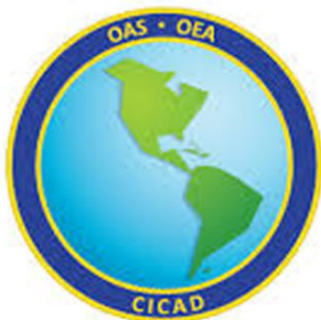
Inter-American Drug Abuse Control Commission