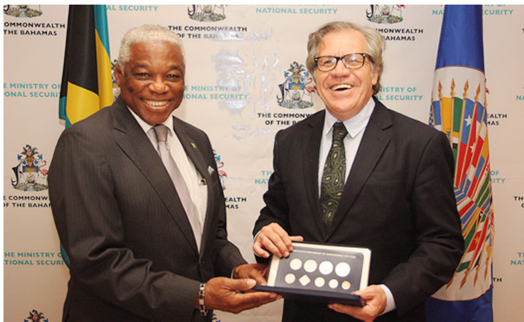
Minister of National Security, Hon. Bernard J. Nottage (left) presents OAS Secretary-General Mr. Luis Almagro with a set of Bahamian Commemorative Coins during the 60th Regular Session of the Inter-American Drug Abuse Control Commission (CICAD) held November 2-4 at Atlantis, Paradise Island, The Bahamas.

PARADISE ISLAND, The Bahamas – Significant interventions must be taken in order to curb or eliminate drug trafficking in the region. This, according to Secretary General of the Organization of American States (OAS) Luis Almagro, will be the best course of action. Mr. Almagro said that drug trafficking and the associated actions that support the trade are a ‘threat to democracy.’