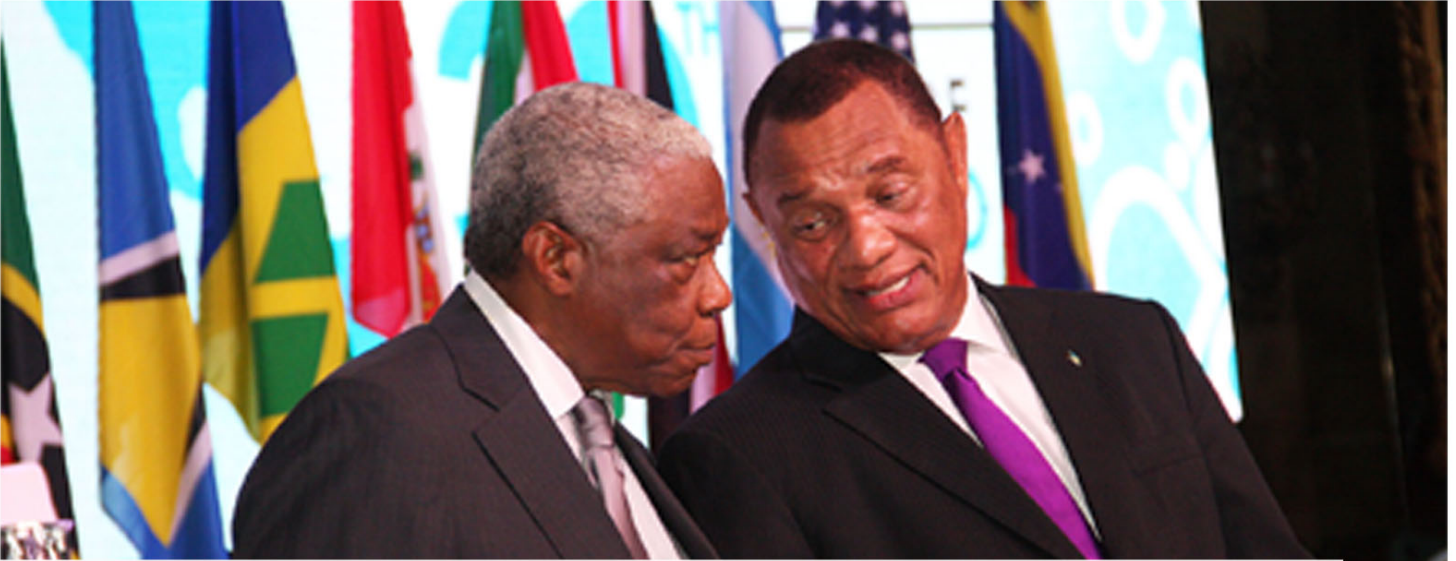
Prime Minister, the Rt. Hon. Perry Gladstone Christie (right) and Minister of National Security, Bernard J. Nottage share a private moment during the Inauguration Ceremony (Opening Ceremony) of the 60th Regular Session of the Inter-American Drug Abuse Control Commission (CICAD) which opened November 2, 2016 at Atlantis, Paradise Island, The Bahamas.