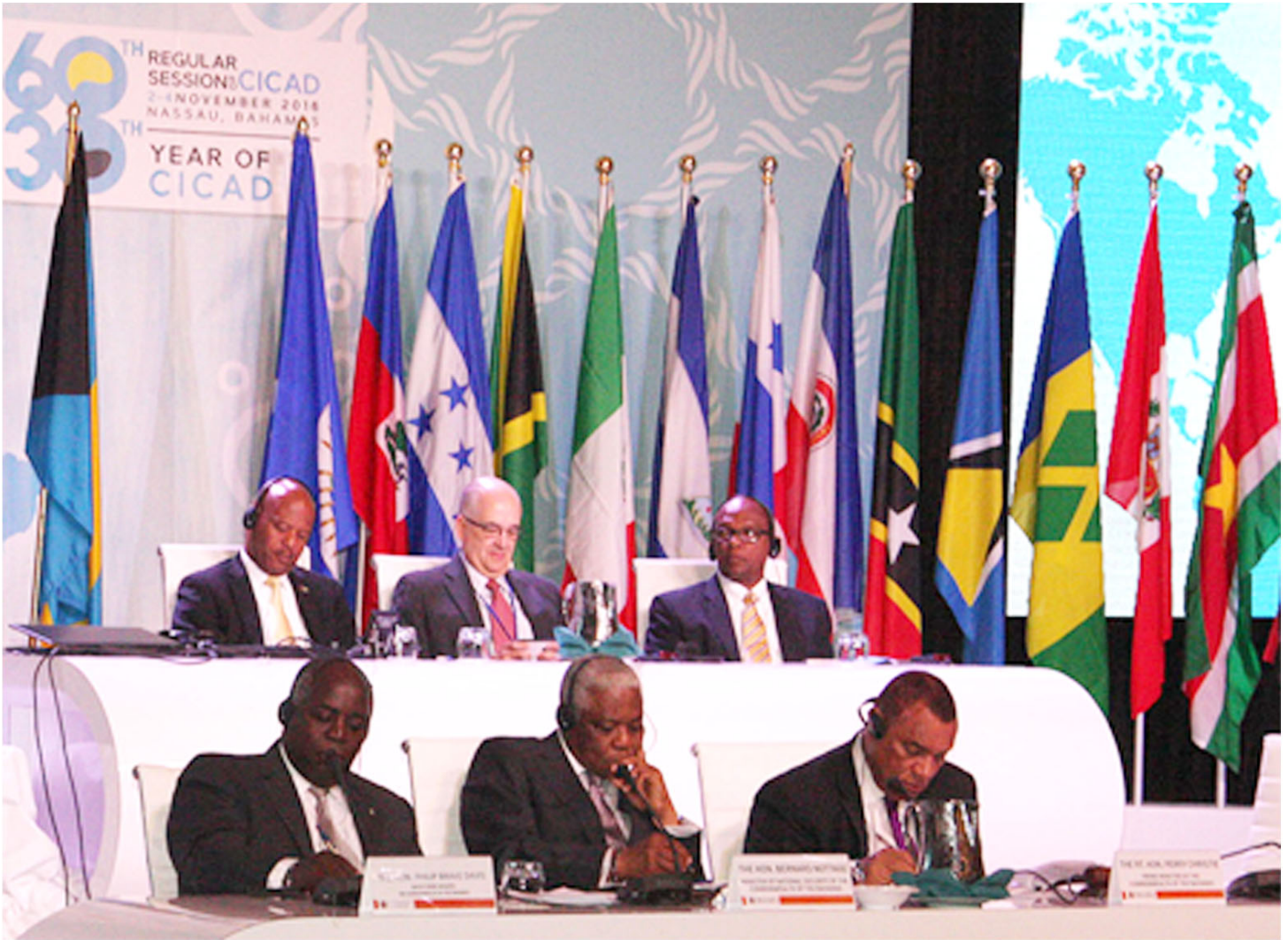
Delegates attending the Inauguration Ceremony (Opening Ceremony) of the 60th Regular Session of the Inter-American Drug Abuse Control Commission (CICAD) Wednesday, November 2, 2016 at Atlantis, Paradise Island, Bahamas. Also pictured (from left at front table) are: Bahamian Deputy Prime Minister, the Hon. Philip E. Davis; Minister of National Security, Bernard J. Nottage and Bahamian Prime Minister, the Rt. Hon. Perry Gladstone Christie.

Some of those issues have been identified as a lack of conflict resolution skills, youth unemployment, an overwhelmed justice system and a deficient rehabilitative correctional process.