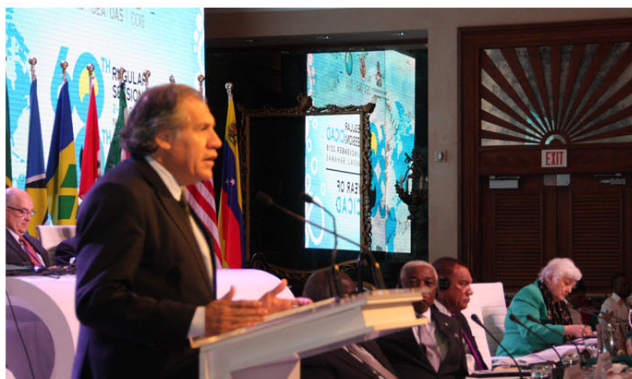
Secretary General of the Organization of American States (OAS) Luis Almagro addresses delegates and guests during the 60th Regular Session of the Inter-American Drug Abuse Control Commission CICAD, which is the Western Hemisphere's policy forum for dealing with the drug scourge. Mr. Almagro is pictured speaking during the opening ceremony of the conference, which was held at the Grand Ballroom, Coral Tower, at Atlantis Paradise Island, November 2-4, 2016.

CICAD was established by the General Assembly of the Organization of American States (OAS) in 1986. Each member government appoints a high-ranking representative to the Commission, which meets twice a year.