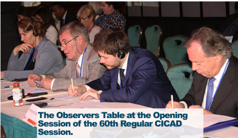
The Observers Table at the Opening Session of the 60th Regular CICAD Session.