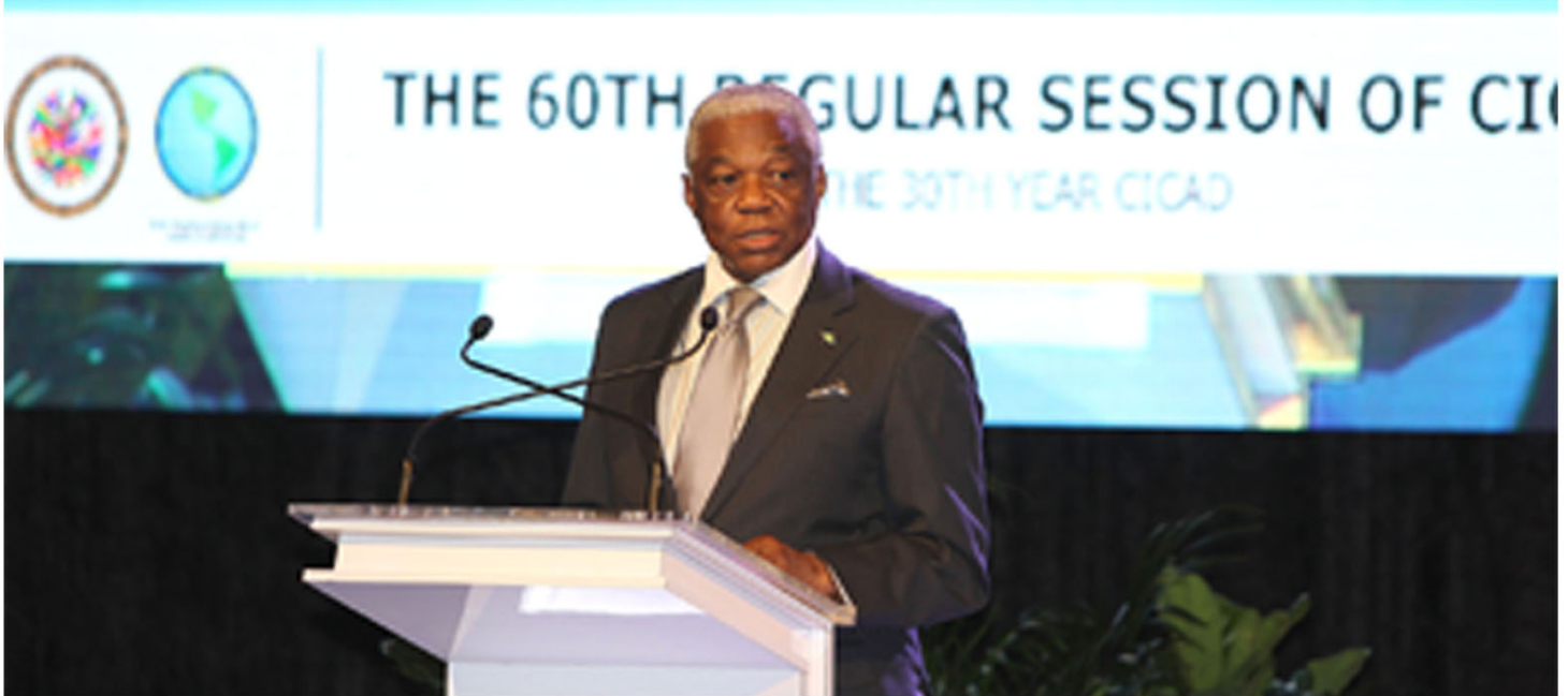
Bahamas Minister of National Security the Hon. Dr. Bernard Nottage.

PARADISE ISLAND, The Bahamas – The Government of The Bahamas is “determined” in its intent that drug trafficking, crime and criminality will not jeopardize the economic, social and political stability and development of the Commonwealth, Minister of National Security, the Hon. Dr. Bernard J. Nottage said Wednesday.