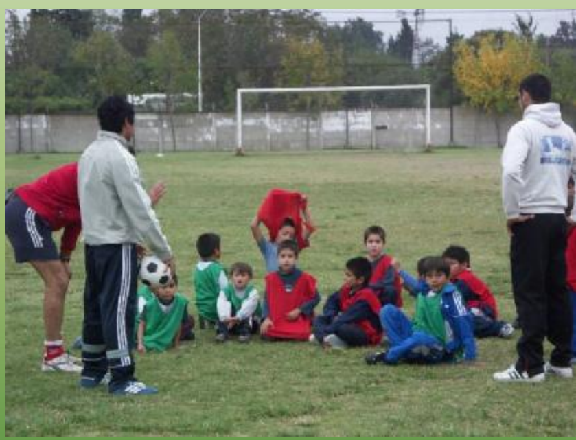
First Month of the Program