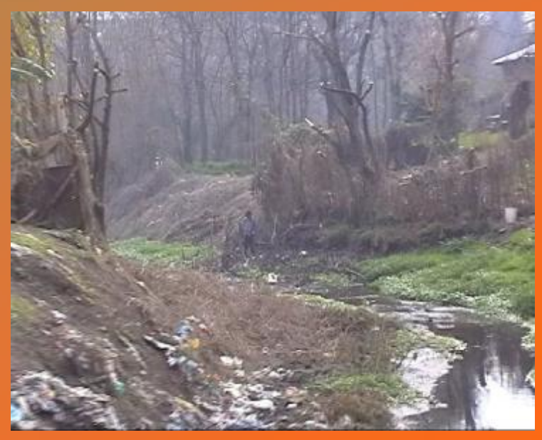
Barrio Los Ceibos