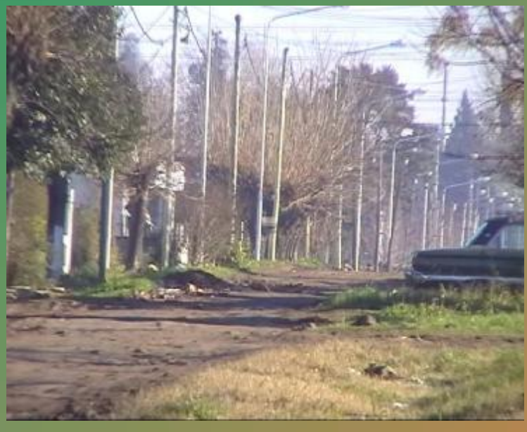
A street de G. Catán