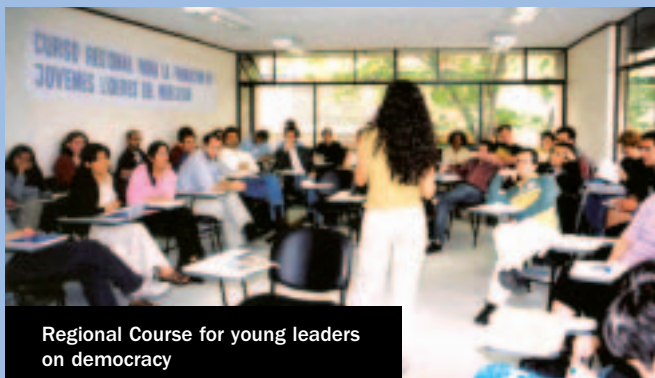
Regional Course for young leaders on democracy