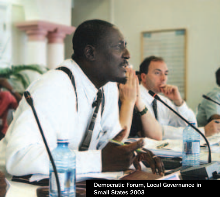
Democratic Forum, Local Governance in Small States 2003