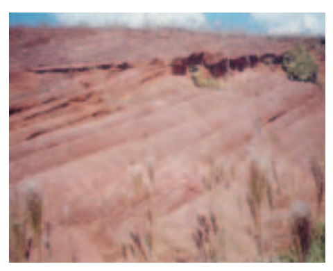
Guarani outcrop at Itapúa, Paraguay

institutional, economical and legal understanding of the GAS. This framework will take the principles of sustainable integrated development, potential use of the aquifer; it will be established within a Strategic Action Plan (SAP), which