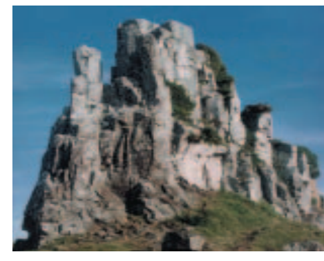
Contact area between Botucatú formation and Serra Geral basalts at Torres, RS, Brazil.