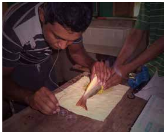
Hormonal induction of the Spotted Rose Snapper.

The ADPG (Asociación para el Desarrollo de Pedro García, Inc.) project in the Dominican Republic involved training workshops, developing environmental initiatives, and engaging civil society with local authorities to promote environmental protection. The project worked with schools, community committees, two municipalities, two district municipalities, other local and national governments, as well with the general public of the two main municipalities of Pedro García and Yásica. Environmental campaigns at first were done very locally, but afterwards these campaigns aimed to influence areas outside the projects limits, up to the point that an environmental service fee was being negotiated with another district in the lower basin for the protection and quality of spring water found in the upper basin (Pedro García and Yásica). In Pedro García, the interest of implementing the three Rs (recycling, reusing, and reducing) has extended to schools, where teachers inspired by the project's initiative have also begun to implement actions in their schools. The main achievements are: