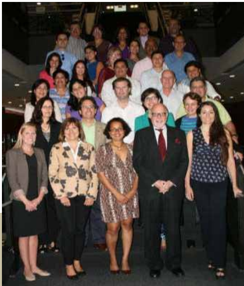
Pathways to Cleaner Production Higher Education Partnership representatives from U.S. and Latin American universities, WEC, and HED during the 2013 partnership annual meeting at IITs campus in Chicago, Illinois.

Several capacity-building events, supported by HED, have created environments for systematic collaboration and information sharing among the partners. For instance, the Universidad San Ignacio de Loyola (USIL) held an event, “Pathways to Cleaner Production for Micro-, Small-, and Medium-Sized Enterprises” , which hosted faculty, students, and representatives from WEC, industry, and the Government of Peru, to expand awareness of the partnership’s work and how CP solutions result in cost savings and long-term sustainability. Also, during the Pathways to Cleaner Production Annual Meeting in Chicago, Illinois, the fourth round of faculty capacity-building workshops were held at the Illinois Institute of Technology (IIT) ( “Diagnostics and Energy Audit for Cleaner Production,” “Life Cycle Assessment and Ecodesign,” and “Business Case and Implementation Strategy for Cleaner Production” ). Twenty-one participants attended the workshop, including 20 faculty members and one representative from the National Cleaner Production Center in El Salvador, greatly increasing their knowledge of CP and SID practices.