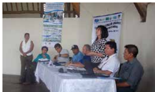
Table of representatives: DIPESCA, CONAP, Municipality of Livingston, Fishermen's Network and project consultants.