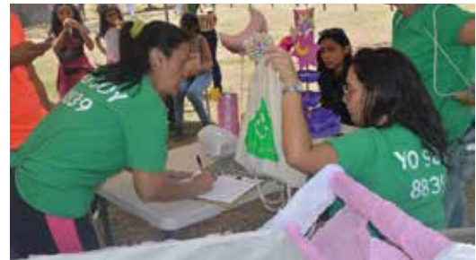
Community project in the district El Hatillo: neighbors and environmental leaders.