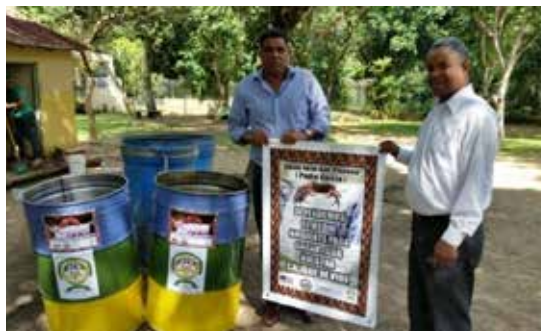
Delivering recycling containers at an Education Center.

The FUNDEMAS project in El Salvador had two main components: (1) training and awareness on environmental protection, and (2) communication and outreach strategies to broaden the impact of the project's key messages on environmental protection. Specifically, this project sought to increase the awareness of civil society on the issues of natural resource management and environmental regulations and procedures in order to promote participatory and informed decision-making in matters of environmental protection through educational and training activities in the municipality of San Salvador. The main achievements were: