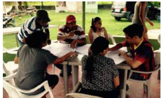
Training for the establishment of gardens in the project communities.