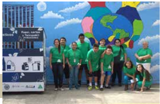
Community project in the district San Sebastian: environmental leaders, the Ecopoint, and mural.