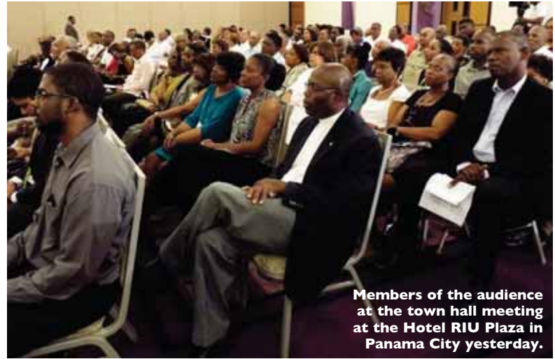
Members of the audience at the town hall meeting at the Hotel RIU Plaza in Panama City yesterday.