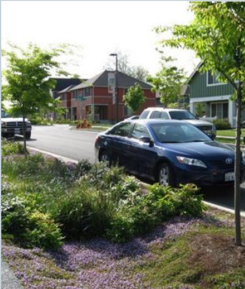
BioSwale – slows storm water flows