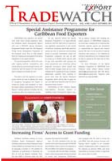
TradeWatch July-October 2011 Previous Publications