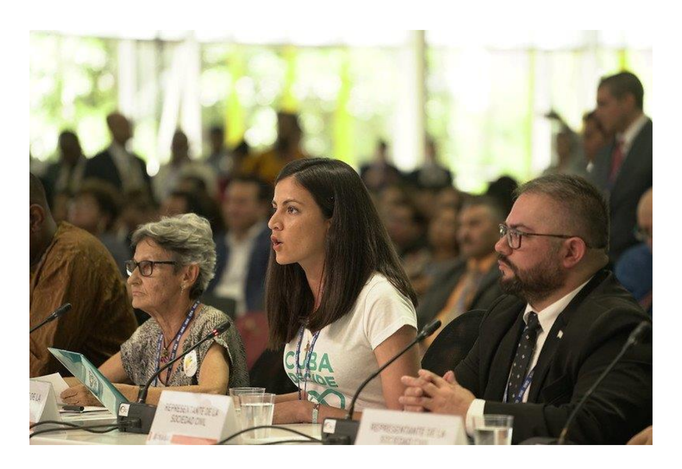
Dialogue of Heads of Delegation, with the Secretary General and representatives of civil society and other social actors

Establishment of two additional civil society coalitions that defend and promote Women's Human Rights, during the forty-ninth regular session of the OAS General Assembly, June 26 to 28, 2019, in Medellin, Colombia, for a total of three coalitions compared to the previous year. Likewise, the percentage of women representatives of civil society organizations in the forty-ninth regular session of the OAS General Assembly was 58%.