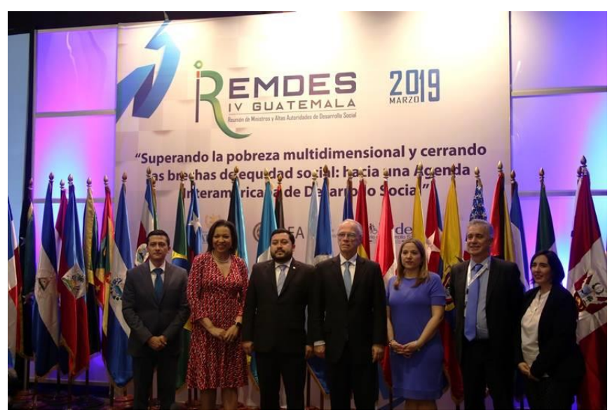
Fourth Meeting of Ministers of Social Development

During the fourth REMDES participants learnt about nine best practices on social policies from the following member states: Brazil, Canada, Colombia, Costa Rica, Chile, Dominican Republic, Ecuador, Honduras and Mexico.