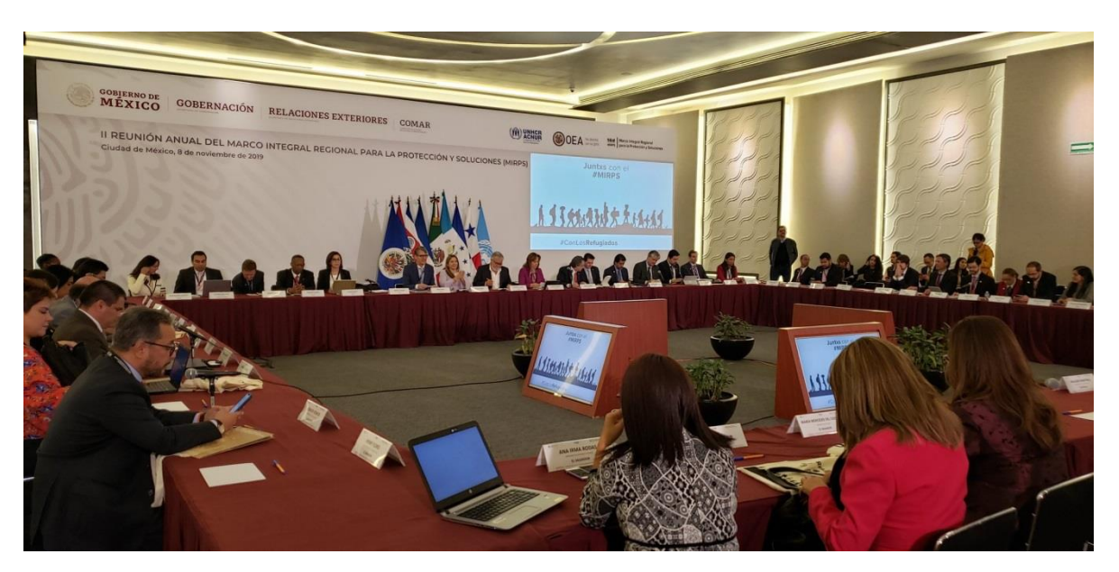
Second Annual Meeting of the MIRPS