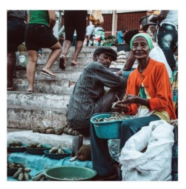
360 VR Photo Exhibition "Afro-descendants in the Americas"

Top left March 29, 2018 Top Right November 23, 2015 Bottom left February 28, 2019 Bottom right January 26, 2019