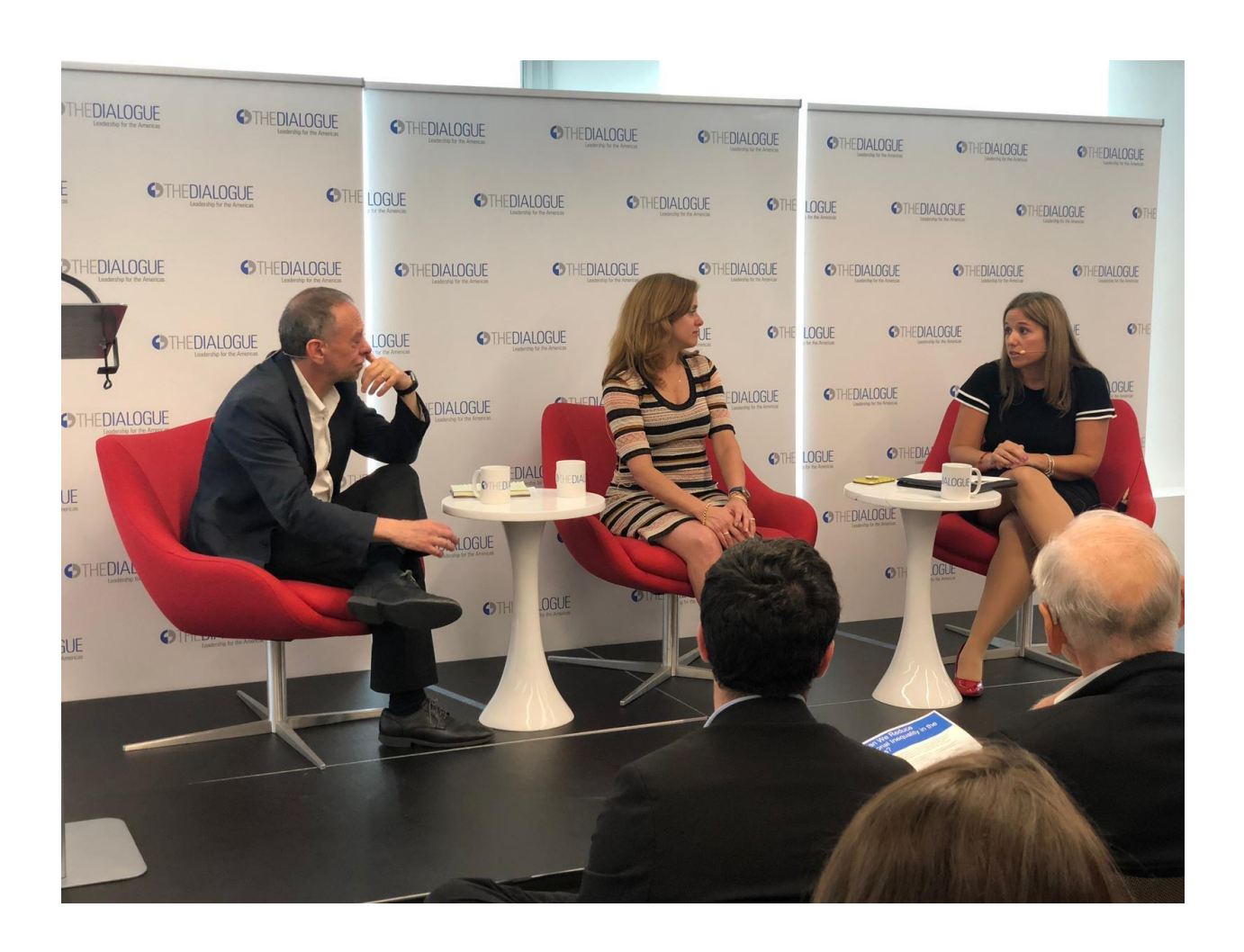
Presentation of the "Interamerican Guide on Strategies for Reducing Educational Inequality"