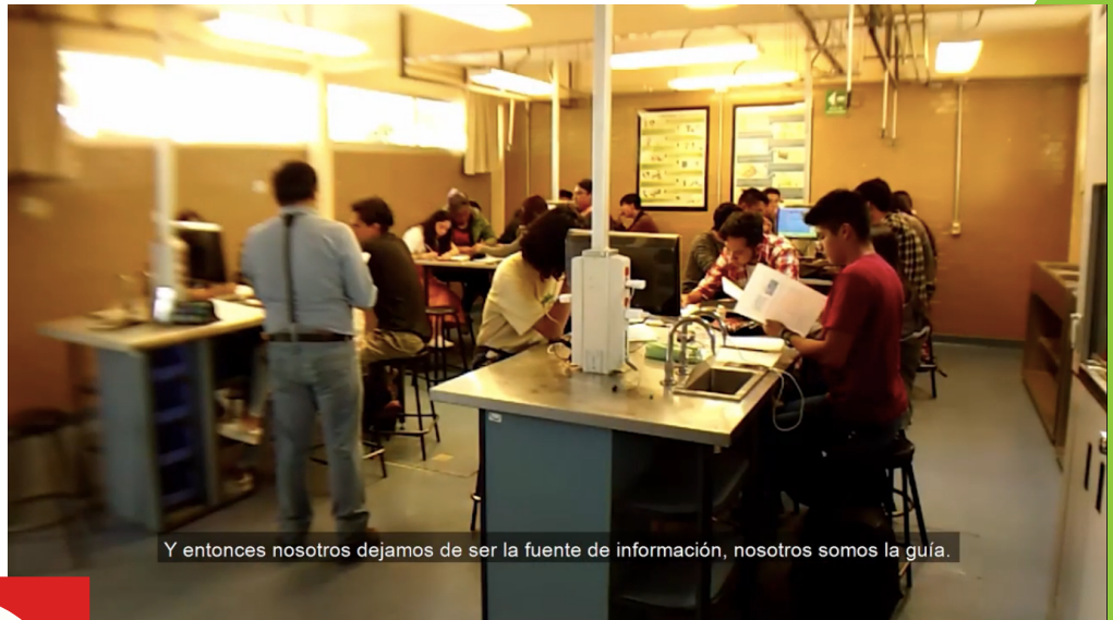
Y entonces nosotros dejamos de ser la fuente de información, nosotros somos la guía.

Offered by the MexicoX platform, the MOOC is aimed at educators of secondary level , teacher training and higher education lasts 40 hours .