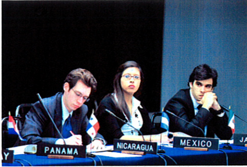
Ceremony, the OAS interns