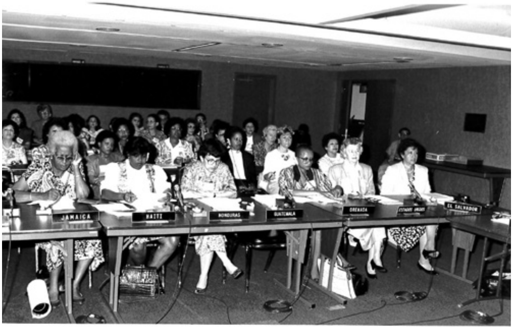
Inter-American Consultation on Women and Violence, Washington DC, 1990.

The CIM designed a multidimensional and multifocal strategy that defined the steps required to identify it, analyze it, and try to put an end to it. It was decided," says Poole, "that it would be a transparent and open process, not a private one, and without restricted documents."<sup>97</sup> The strategy envisaged having the "participation and support of civil society at the national level and to obtain the accompaniment of the OAS decision makers."<sup>98</sup>