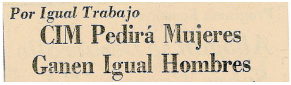
Newspaper article headline.

In the 1950s, with the battle for women's suffrage almost won with the approval of the Convention on Political Rights and the Convention on Civil Rights, the CIM's priorities shifted to social and economic rights<sup>77</sup> and raising awareness of the difficult reality faced by many women in Latin America and the Caribbean.<sup>78</sup> In 1951, the CIM promoted the First Regional Seminar on the Civil, Political, Economic, Social and Cultural Rights of Women, which had always been part of its agenda.