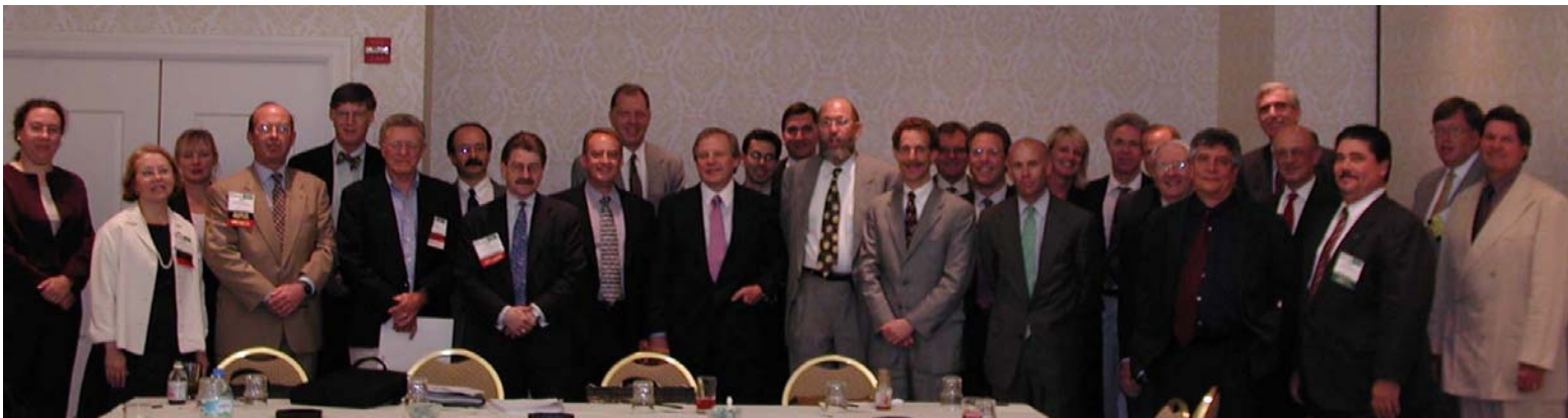
Meeting of the Advisory Board with Board of Directors and Steering Committee, July 10, 2002