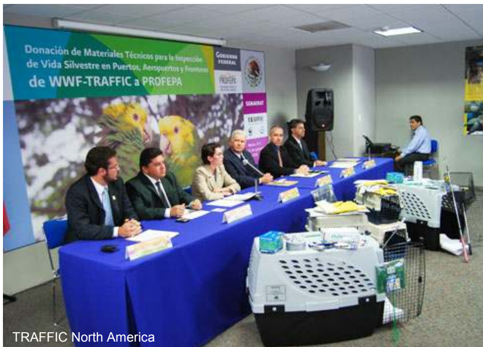
TRAFFIC North America