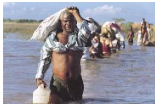
Mozambique floods, UNEP