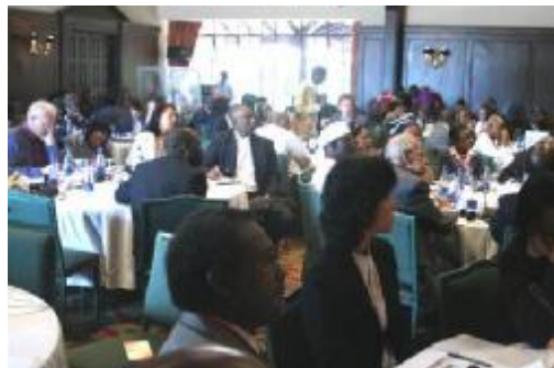
Pan-African Forum on IDRL Nairobi, 14-15 May, 2007

http://www.ifrc.org/what/disasters/IDRL/advocacy/americas.asp