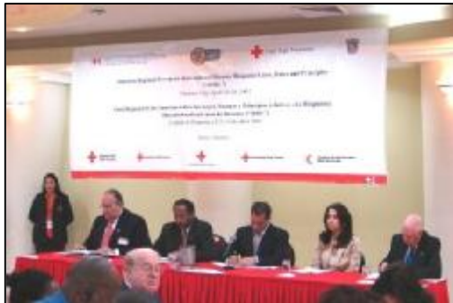
Americas Forum on IDRL Panama City, 23-24 April, 2007

The third Forum on IDRL was co-convened with the Panamanian Red Cross and the Organization of American States. It was hosted by the Government of Panama. Over 100 participants took part, representing 20 Governments, 28 National Red Cross Societies, 6 regional organizations, 11 inter-governmental organizations, 8 NGOs and civil society organizations, and 4 universities.