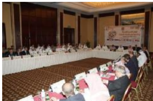
Middle East Forum on IDRL Abu Dhabi, 19-20 June, 2007

http://www.ifrc.org/what/disasters/IDRL/advocacy/africa.asp