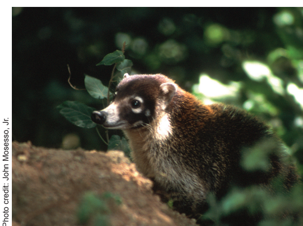
White-nosed coatis, native to nine countries of the Western Hemisphere

Sponge, coral, and searod in the Caribbean