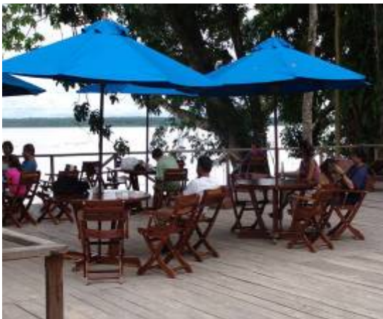
Amacayacú Park: Visitors Center

In this manner, the initiatives integration is not only required under international circumstances, but also nationwide. As an example, it has been established bilateral agreements between protected areas, which is the case in the reserve area Gueppi and the National Natural Park La Paya, between Peru and Colombia; the hub area Tabatinga – Apaporis, between Brazil and Colombia, or the agreements under the framework of the Presidential Committee for Boundary Affairs –COPIAF- between Venezuela and Colombia.