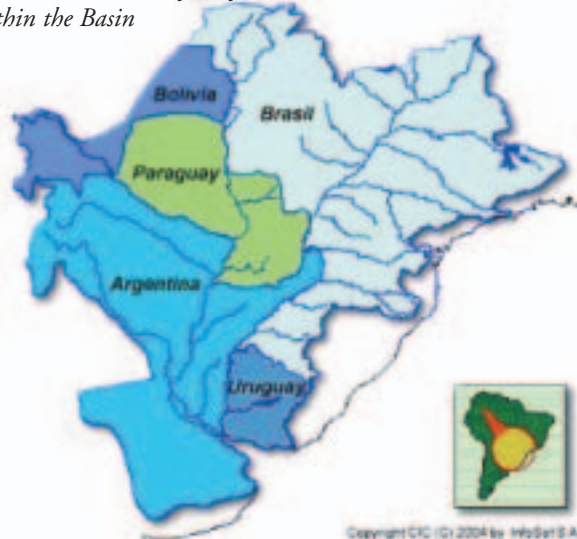
National Territories of the five La Plata Basin countries within the Basin

COUNTRIES: Argentina, Bolivia, Brazil, Paraguay, and Uruguay