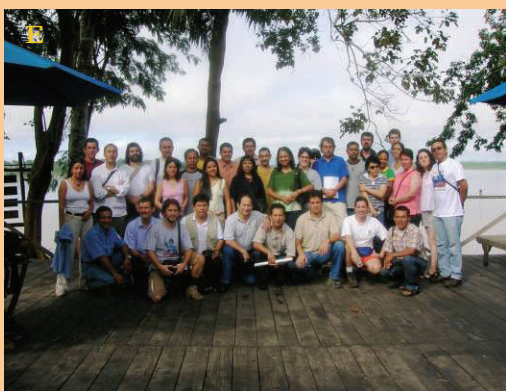
Some of the participants in the Second Workshop in the Amacayacu National Natural Park in Colombia 2006

The purpose of this network is to share data, information and knowledge using suitable technology and media, in order to improve the efficiency in the adaptive management for conservation of the biodiversity and the harmonious relationship with the communities related to the areas.