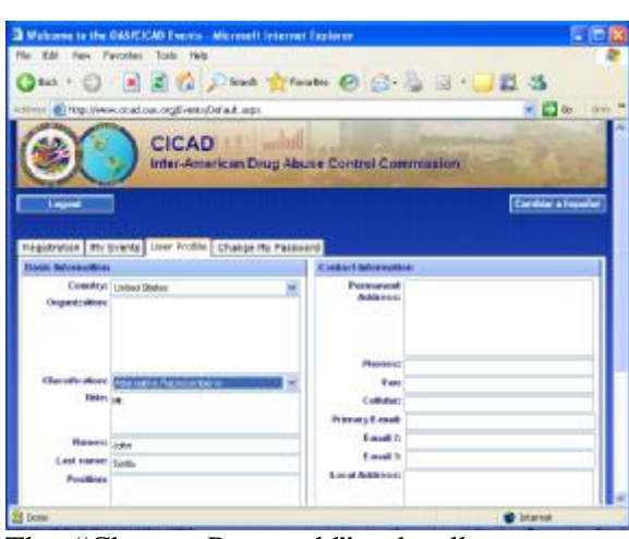
The "Change Passworld" tab allows you to define a new password for accessing the system. You will then be able to log on and change any information in your profile.

To select a specific document, click on the description.