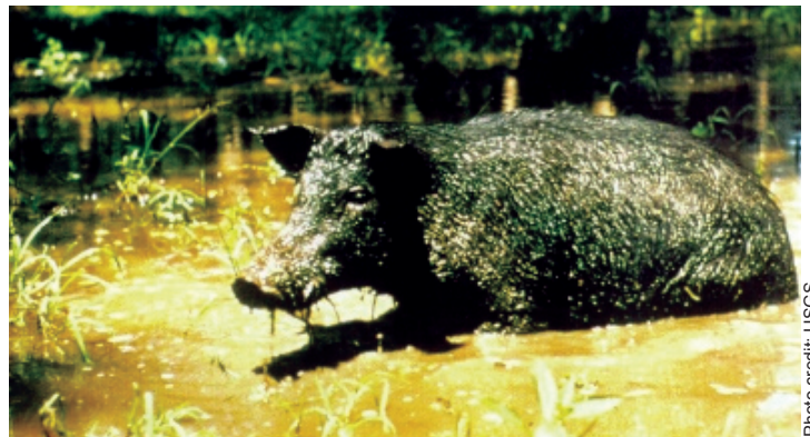
Invasive pigs are reported by all I3N countries.

Portuguese, and English) is a Microsoft Access™ -based product that allows network members to collect and share standardized information on IAS taxonomy, introduction, biology, ecology, impacts, control methods, occurrence (including geographic data), contacts, projects, and references. Developed through