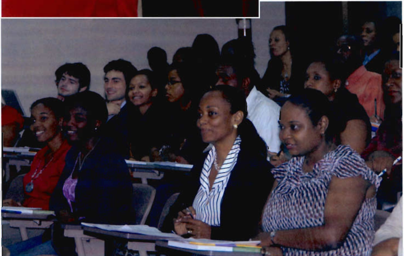
Participants on Day I.