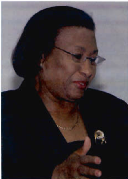
Keynote Speaker, the Hon. Dorothy Lightbourne Q.C., Minister of Justice and Attorney General.

The Keynote Speech at the Seminar was given by Senator the Hon. Dorothy Lightbourne Q.C., Minister of Justice and