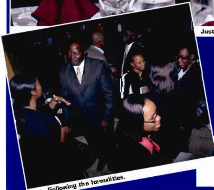
Following the formalities.